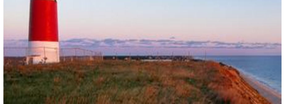
Sankaty Head Lighthouse