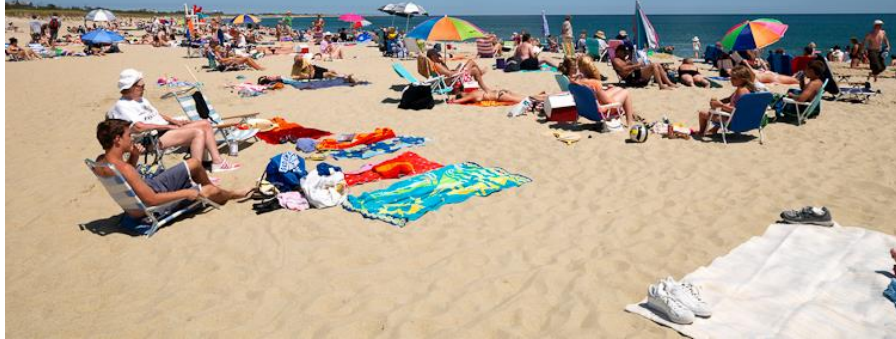
Jetties Beach on a busy day