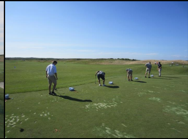
July Full Swing Station