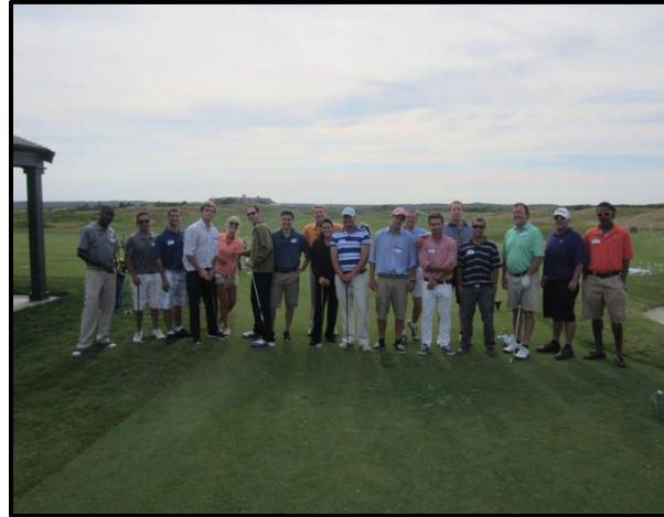
July Group Photo