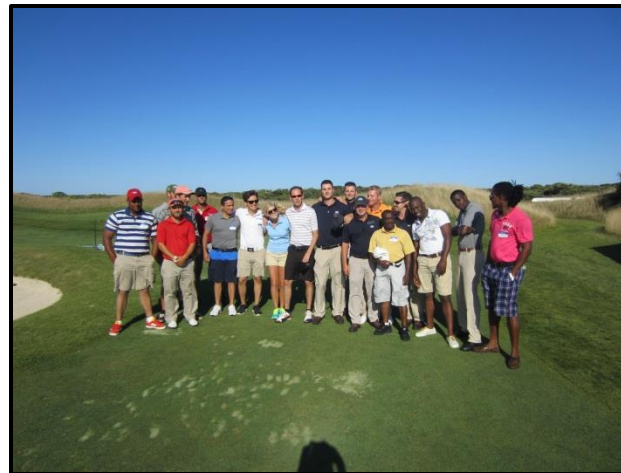
August Group Photo