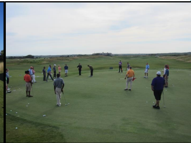
August Putting Contest