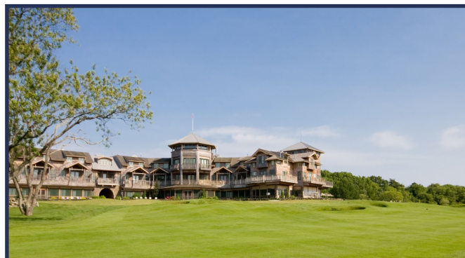
Carnegie Abbey-- October 1, 2018