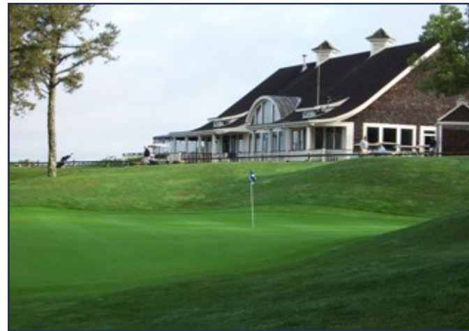
Olde Barnstable Fairgrounds GC