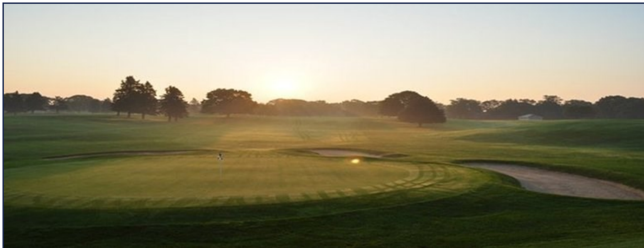
Pawtucket CC– May 8, 2018