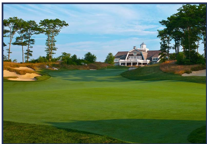
Shelter Harbor GC

The first event of the 2018 Stroke Play Series is right around the corner, at Shelter Harbor Golf Club on May 15th! These five SPS events (at Shelter Harbor GC, Blue Hill CC, Manchester CC, Purpoodock Club, and Granite Links GC) will all count towards the season-long OMEGA-Wogan Player of the Year and Avidia Cup points races. The Series will