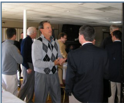
NHC members gather prior to Spring Meeting