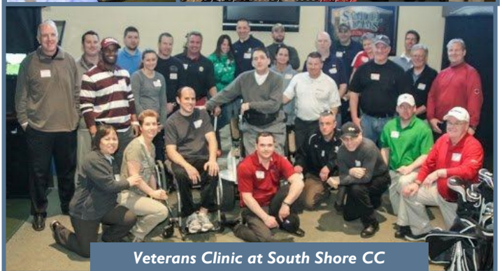
Veterans Clinic at South Shore CC