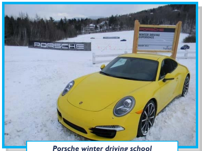
Porsche winter driving school at Sugarbush Golf Club