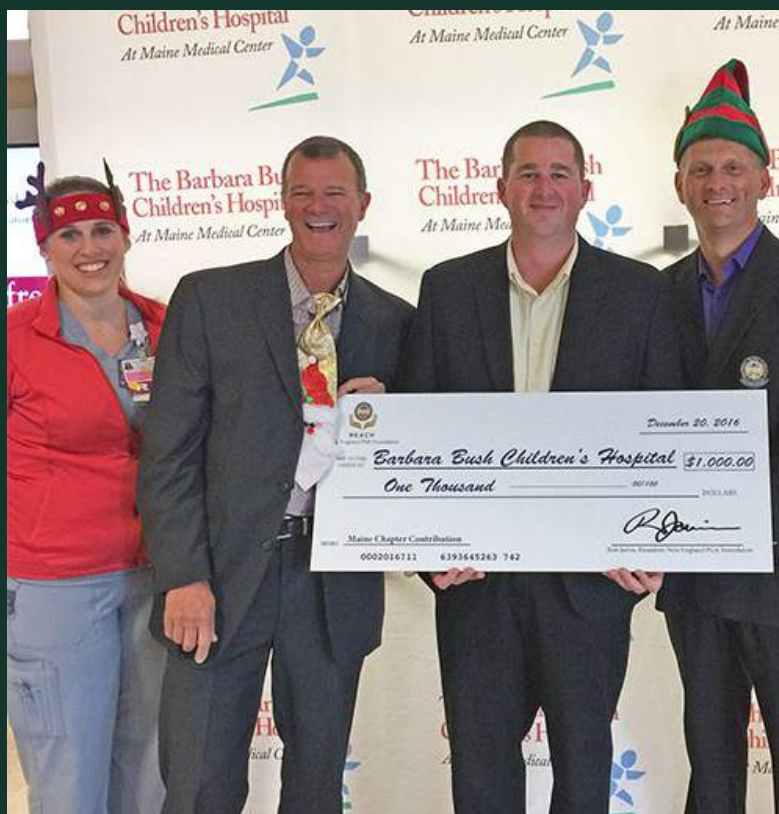
The Maine Chapter visits the Barbara Bush Children's Hospital