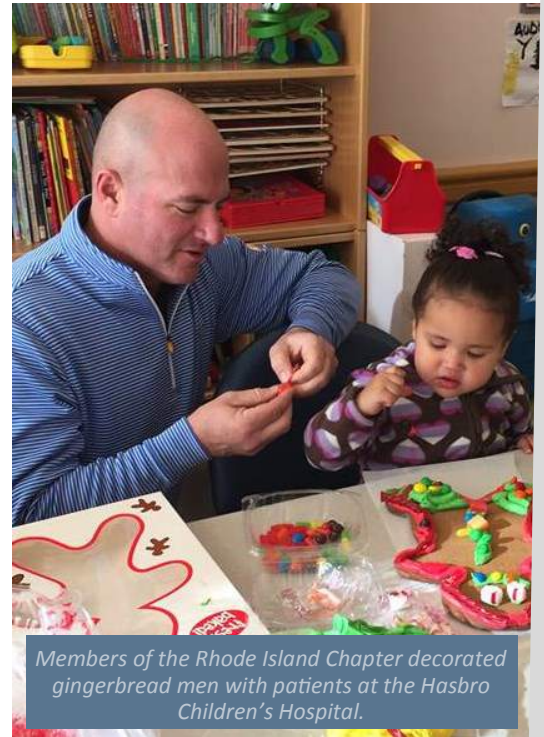
Members of the Rhode Island Chapter decorated gingerbread men with patients at the Hasbro Children's Hospital.

Our partnership with Avidia Bank includes a percentage of purchases made with NEPGA Avidia Credit Cards will be donated back to our Foundation. It is this generous gift that helped make this launch event possible. Leaders from each chapter found a deserving hospital, or children-specific group, and donated $1000.00 in toys and gifts to them this Holiday Season. I have spoken with