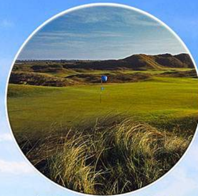
The Island GC