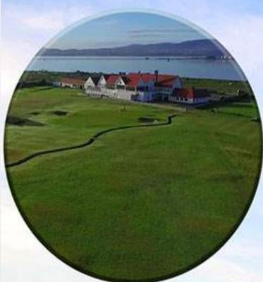
Royal Dublin GC