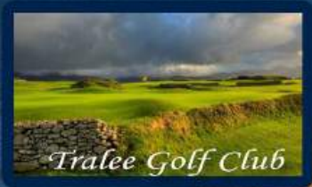
Tralee Golf Club