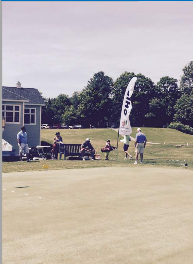
NEPGA Drive, Chip & Putt qualifier at Val Halla GC