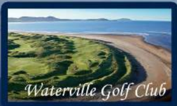
Waterville Golf Club