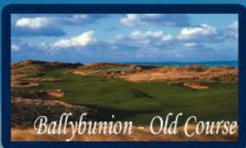
Ballybunion - Old Course