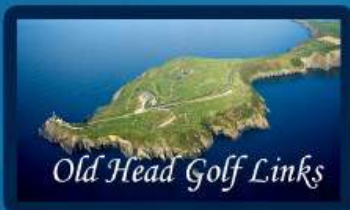
Old Head Golf Links