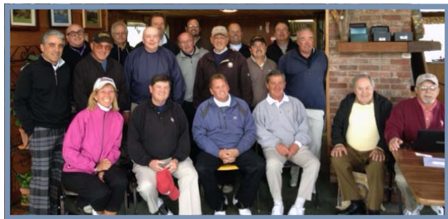
Seniors' Association Spring Meeting at Middleton GC on April 27th