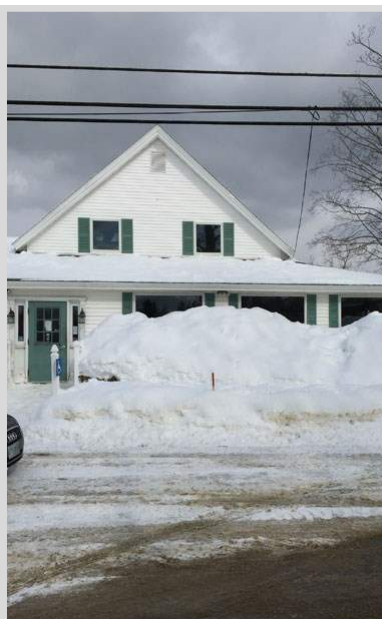
Nippo Lake