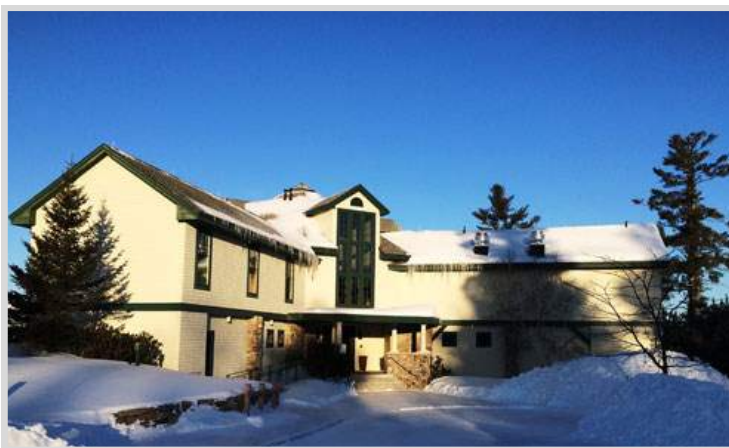
Lake Winnepesaukee CC