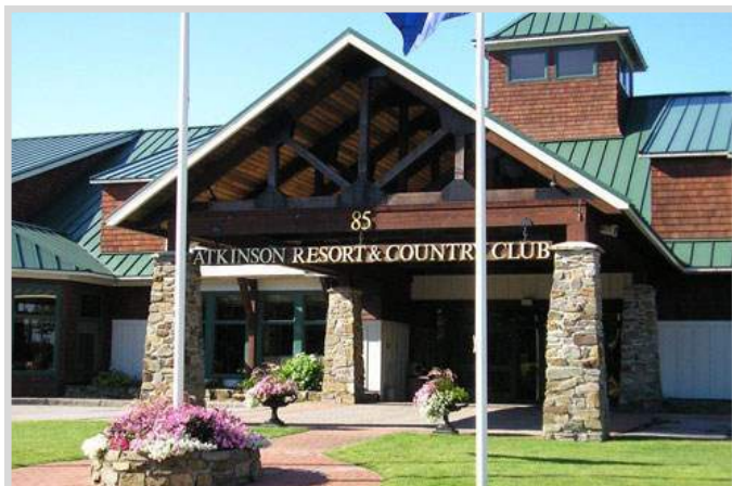
Atkinson Resort & Country Club

Quality of golf course Quality of ownership and management Outstanding contributions to the local community Significant contributions to the game of golf