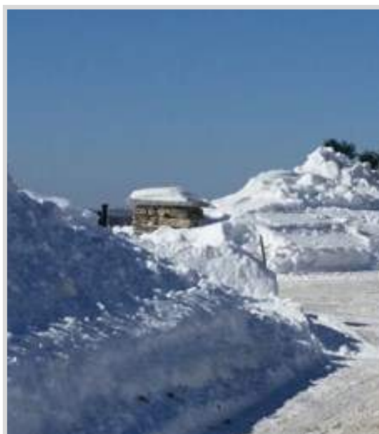
The entrance to Baker Hill