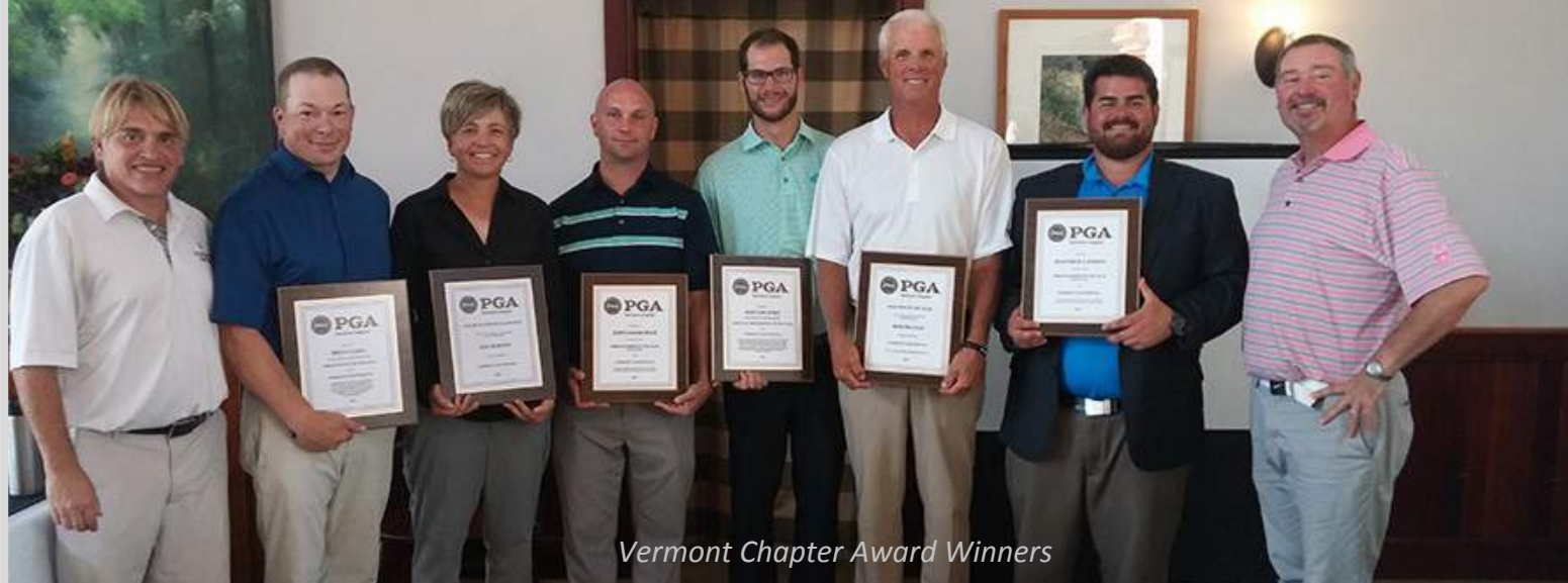
Vermont Chapter Award Winners