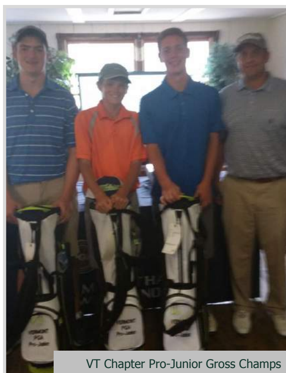
VT Chapter Pro-Junior Gross Champs

Monday, October 3 Okemo Valley GC Pro Am