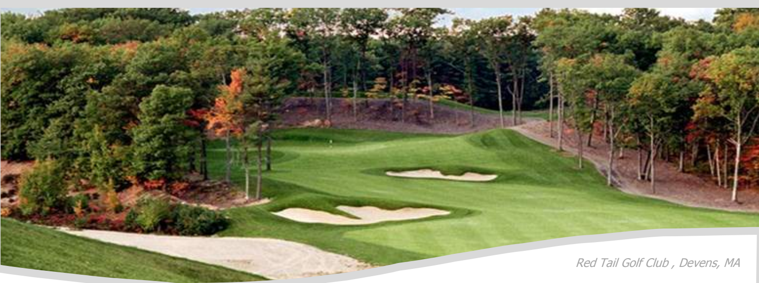
Red Tail Golf Club , Devens, MA