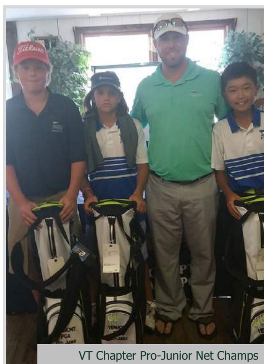
VT Chapter Pro-Junior Net Champs