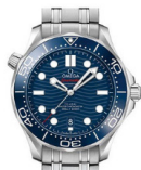
Look for Daniel Craig wearing the watch in the upcoming James Bond movie!